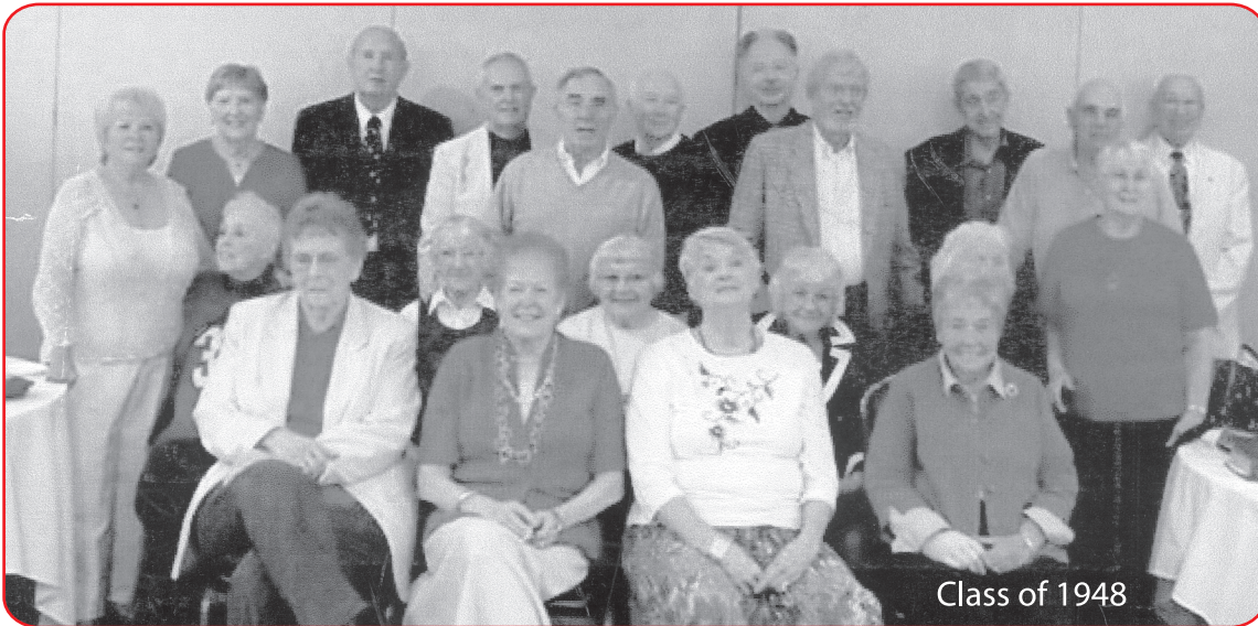
Class of 1948